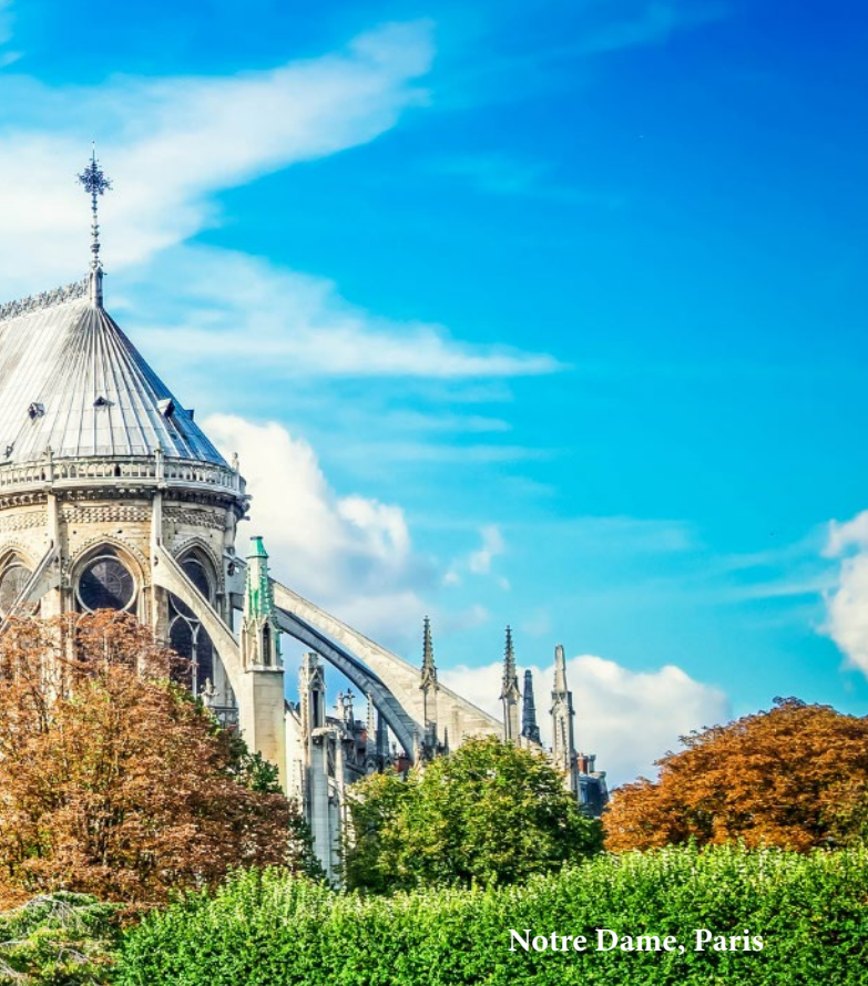
Notre Dame, Paris

where miraculous healings have occurred before returning to our hotel. Dinner, candlelight procession, and overnight accommodations will be at your hotel.