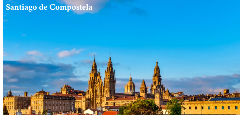
Santiago de Compostela

After breakfast, our guide will take us on a full-day tour of Santiago de Compostela. We will walk the last kilometers of El Camino until we reach the Cathedral of St. James, where we will celebrate the International Pilgrim Mass. While here, you will have the opportunity to embrace the image of Santiago and visit his crypt. Dinner and overnight accommodations will be at your hotel.